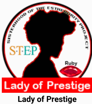
Lady of Prestige