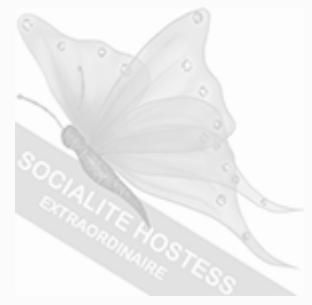
Not Yet Earned