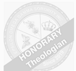
Not Yet Earned