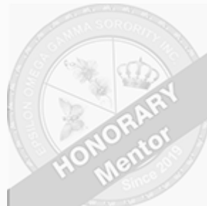
Not Yet Earned