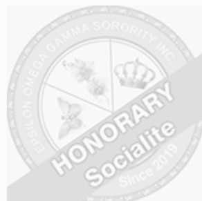
Not Yet Earned