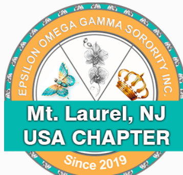
MT. LAUREL CHAPTER, NJ