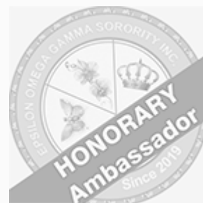
Not Yet Earned