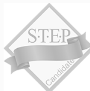
Not Yet Earned