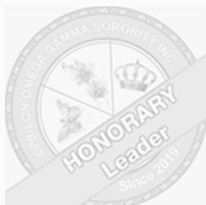
Not Yet Earned