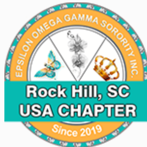
Rock Hill Chapter, SC