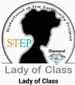
Lady of Class