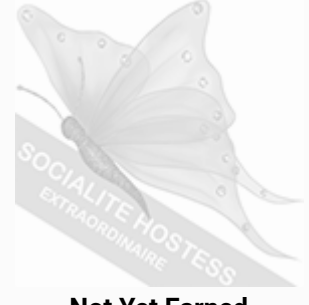
Not Yet Earned