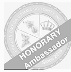
Not Yet Earned