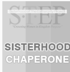
Not Yet Earned