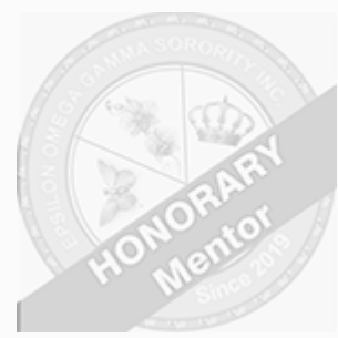
Not Yet Earned