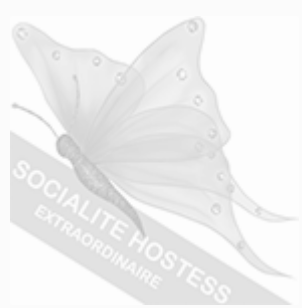
Not Yet Earned