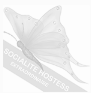
Not Yet Earned