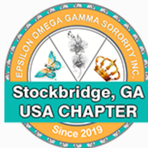
Stockbridge Chapter, GA