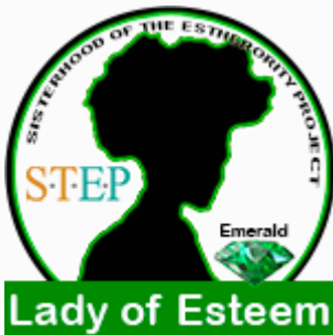
Lady of Esteem