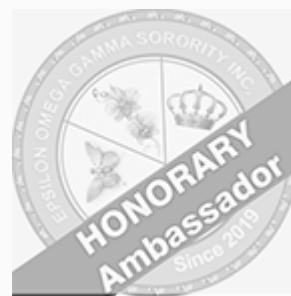
Not Yet Earned