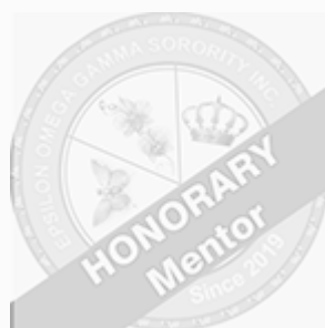
Not Yet Earned