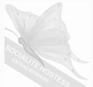
Not Yet Earned