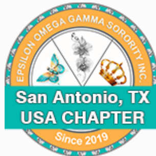
San Antonio Chapter, TX