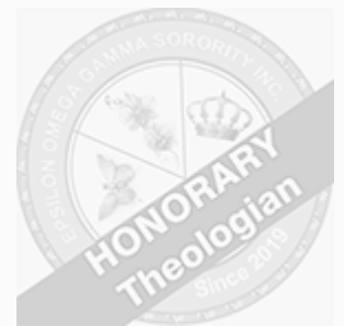
Not Yet Earned