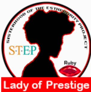
Lady of Prestige