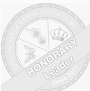
Not Yet Earned