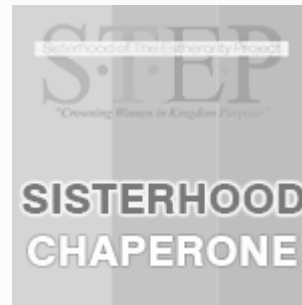
Not Yet Earned