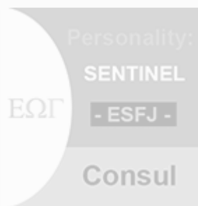
Not Yet Earned